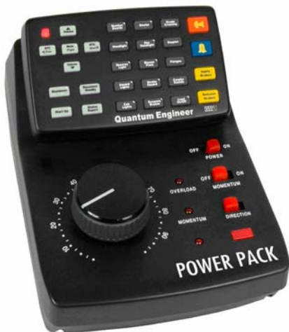
Quantum Engineer (shown with DC Power Pack) allows full feature function of the Quantum Revolution system in Analog DC.